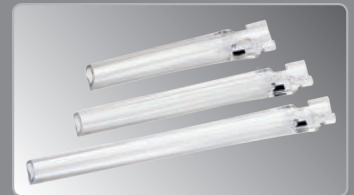
PROTIP420 . PROTIP520 . PROTIP620 (each sold separately)